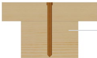
Façade with board directly on substructure