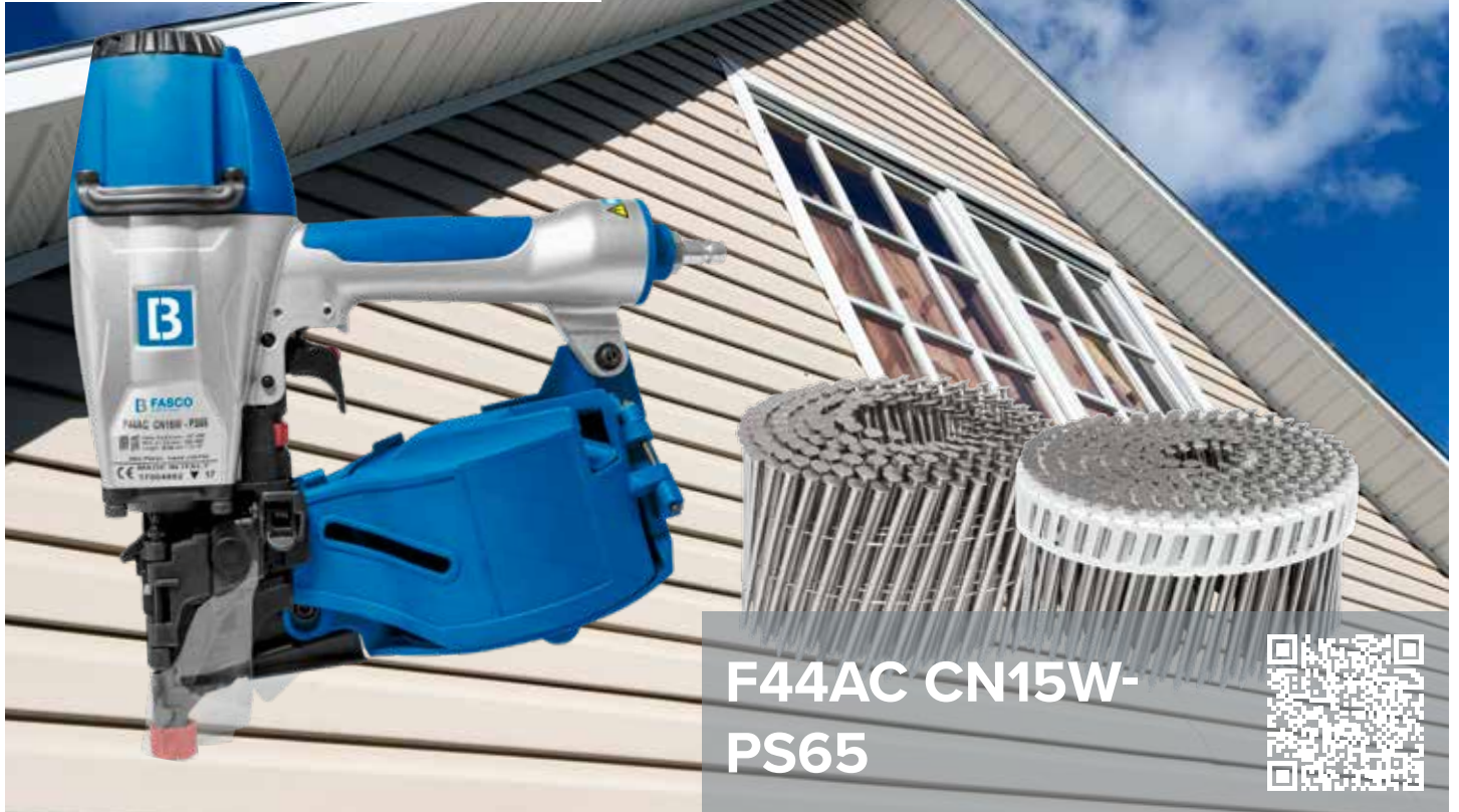
F44AC CN15W- PS65