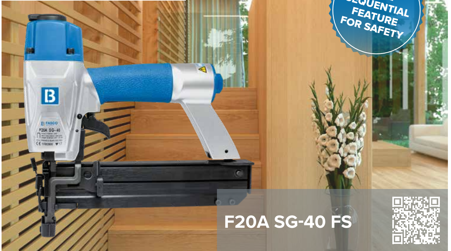
F20A SG-40 FS